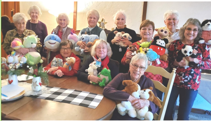
December 12, 2023 Ladies Lunch Guests and New Cuddly Friends for Liberty House Children