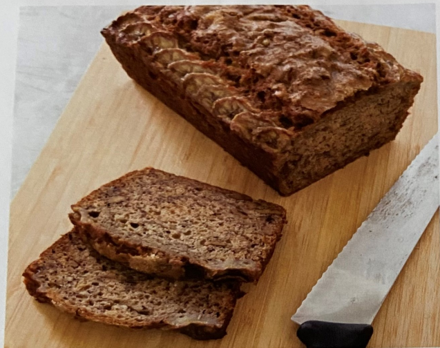
Even though it is chock-full of bananas (we use six), our loaf boasts a tender (not wet) texture.

TOTAL TIME 2 hours INGREDIENT PREP TIME 15 minutes ACTIVE COOKING TIME 1 hour 20 minutes