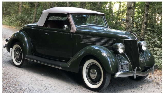
Gary Shoepe's '36 Roadster