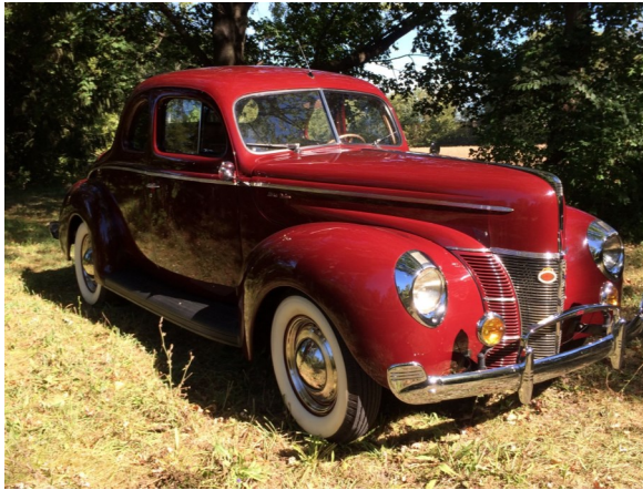
Tom Aylward's '40 Deluxe Coupe

CRRG#10 Member Car Pictures Submitted to be considered for the 2023 Swap Meet Poster: These are the 7 that have been sent so far.